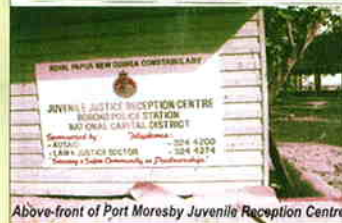
Above-front of Port Moresby Juvenile Reception Centre